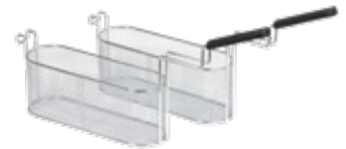
2 half size baskets for EVO700 and EVO900 - 14 and 15lt