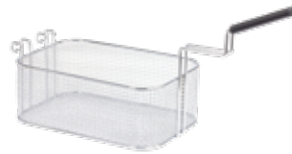
Full size basket for EVO700 and EVO900 - 14 and 15lt