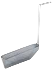
Sediment trays for EVO700 and EVO900