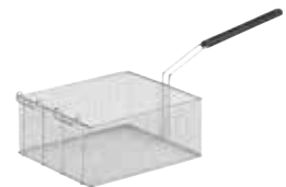
Full size baskets for EVO900 - 18 and 23lt