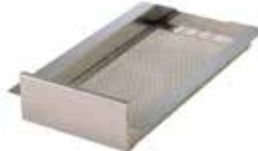
Oil filter for EVO700 and EVO900 - free standing