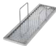
Kit for advanced filtration for EVO900 - 23lt