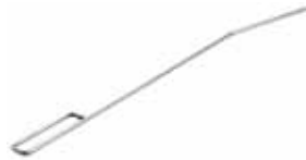
Unclogging rod for EVO700 and EVO900