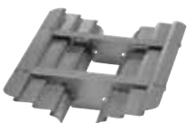
Deflector for EVO700 and EVO900