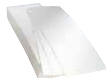
Paper filter for advanced filtration for EVO900 - 23lt