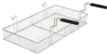
Full size basket for EVO700 - 34lt