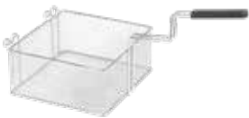
Half size basket for EVO700 - 34lt